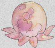
Harvest Moon September 29th