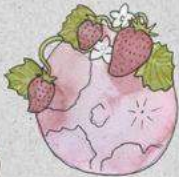
Strawberry Moon June 3rd