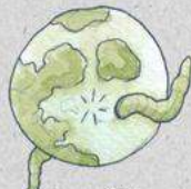
Worm Moon March 7th