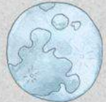
Blue Moon August 30th