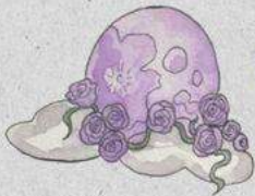
Flower Moon May 5th