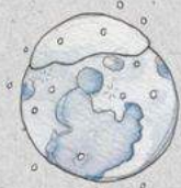
Snow Moon February 5th