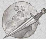
Hunter's Moon October 28th