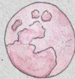
Pink Moon April 6th