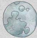
Cold Moon December 26th