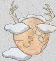
Buck Moon July 3rd