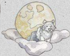
Wolf Moon January 6th