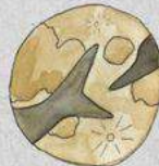
Sturgeon Moon August 1st