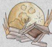
Beaver Moon November 27th