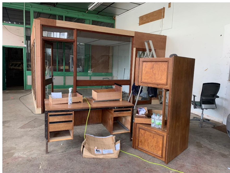
Look out for more photos in the next Newsletter