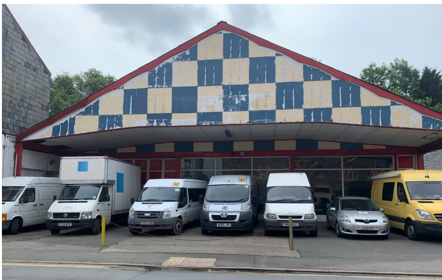
Our new home, the Lion Garage, Bult Wells