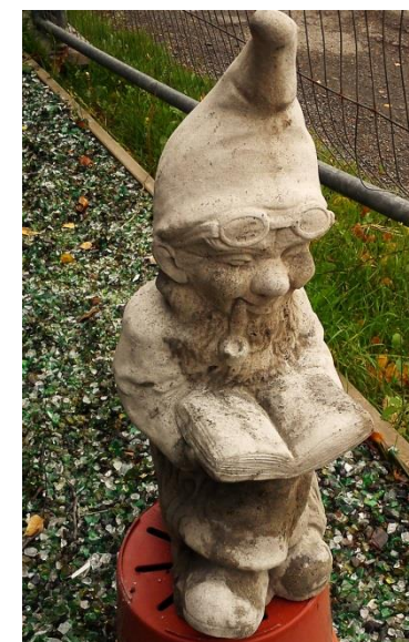
Gnome Reading £12.50 plus VAT