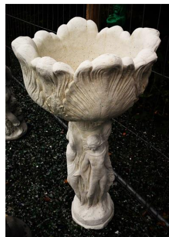
Garden Cabbage Planter £25 plus VAT