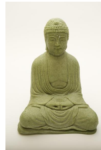
Buddha on Plinth £25.00 plus VAT