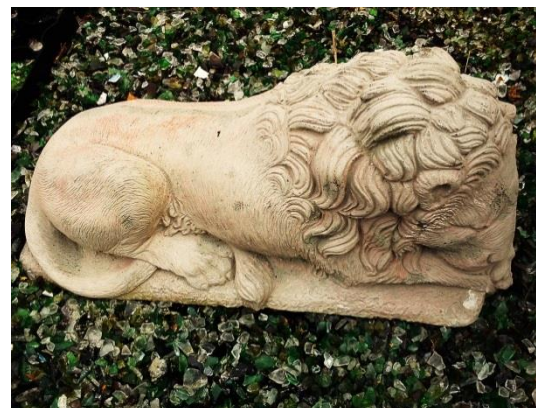
Sleeping Lion £35.00 plus VAT

Prices on the items shown are a Special Introductory Offer and are priced excluding VAT at the current rate.